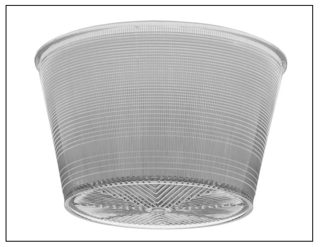
Model 220 Type V