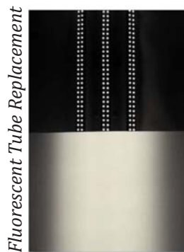
Fluorescent Tube Replacement Orientation: